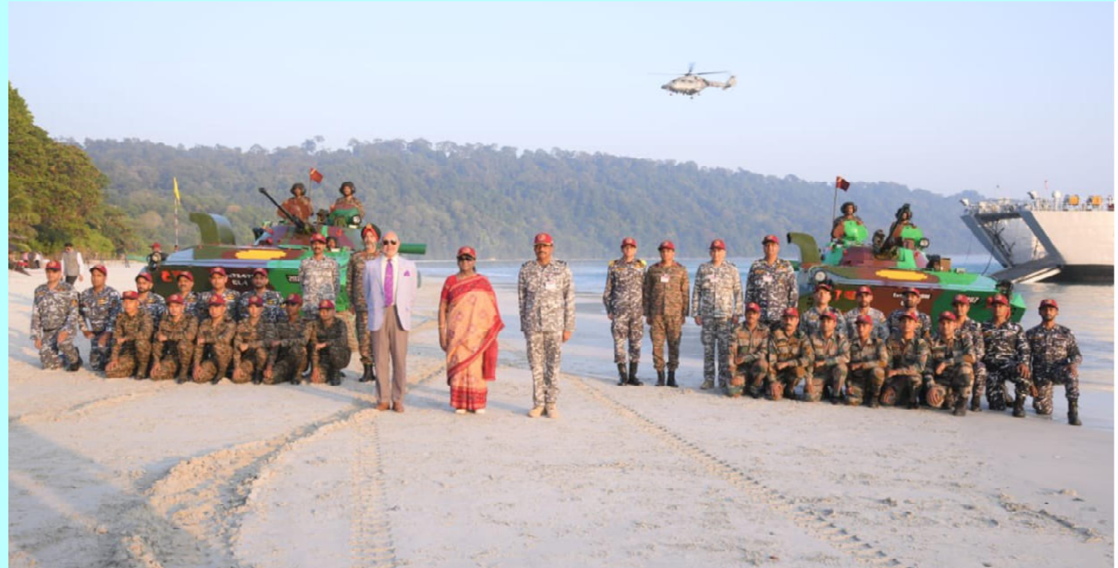
Hon'ble President in a group photograph at the Joint Services Operational Demonstration by A&N Command at Radhanagar Beach, Swaraj Dweep on February 21

infantry troops, utilising BMPs with over 150 combatants landing on the beach. Naval Gun Fire Support (NGFS), Counter Surface Force Operations (CSFO), Search and Rescue (SAR) operations, and vertical replenishment at sea were also demonstrated. The amphibious landing of infantry troops on the beach was executed by Landing Ship Tank (Medium) and Landing Craft Utility (LCU). The operational demonstration culminated with the flypast of Dornier aircraft, MI-17 V5, ALH and Chetak helicopters flying in close formation depicting the Joint Services synergy and combat potential of the Andaman & Nicobar Command.